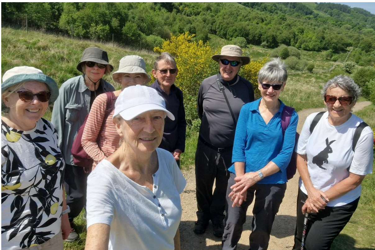
Arriving back at the church car park, most of the group drove from there to the Beech Tree Inn for some well-earned refreshments, sitting outside in the sun. Altogether a lovely day.